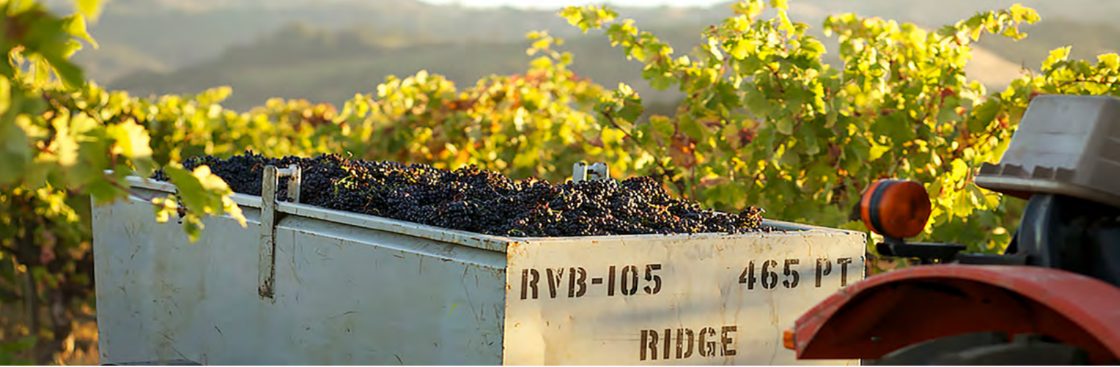
Yesteryear's harvest is today's expressive, classic California vintage in a bottle—at a great price.