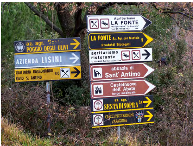
Follow the signs to K&L favorite Sesta di Sopra in Montalcino.

It was in Montalcino at the annual Benvenuto Brunello, where the new vintage is released and tasted for the first time. I had never heard of Sesta di Sopra before, as this was their first release. But I was incredibly impressed with their 1999 Brunello. I thought it was one of the best of the vintage. I was very interested in buying their wine, so I wrote to them asking who their importer was, and they responded, "We don't have an importer. Would you like to be our importer?" We were their first client and it has been a love story ever since. I can always tell how much they're loved by how many times the staff asks me when their wines are arriving—it's an annual rite for them to stock up for themselves before they let you know.