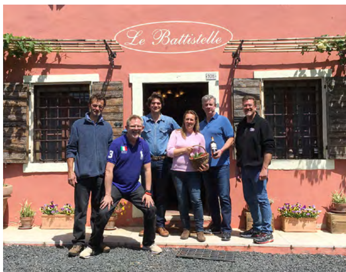
K&L's Team Italy drops in on Le Battistelle.