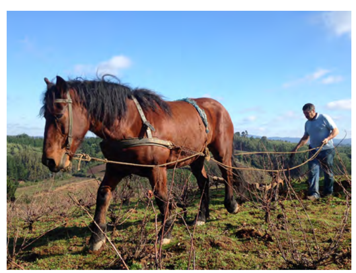
De Martino's radical transformation includes plowing by horse.