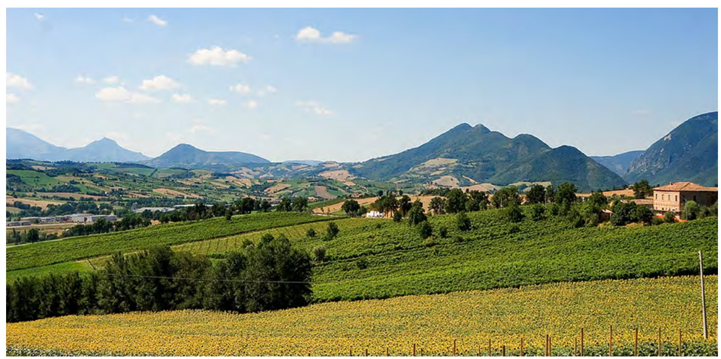
La Monacesca vineyard and Apennine Mountains.