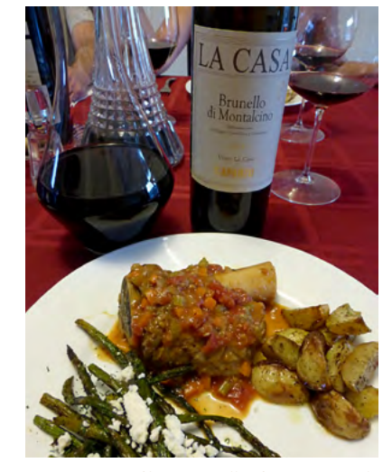
La Casa, one of best Brunellos from Montosoli.

2010 Caparzo Brunello di Montalcino "La Casa" ($59.99) Caparzo has a very bright, silky smooth mouthfeel followed by the initial lively cranberry,