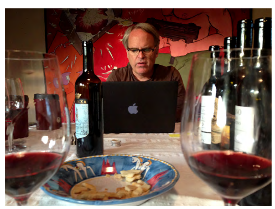
James Suckling tasting the 2010 Brunello "vintage of a lifetime" last September.

($42.99) 4.5 stars \star\star\star\star ½ The nose is a wild combination of cigar ash, salted plum, cedar and bergamot—never thought I'd write that combination, but it really works. On the palate the wine has serious depth, richness and an underlying sensation of complexity. The finish is long, bold and flamboyant, lots of texture and sweet fruit. For a more New World style of Brunello, this is excellent. 1,583 cases produced.