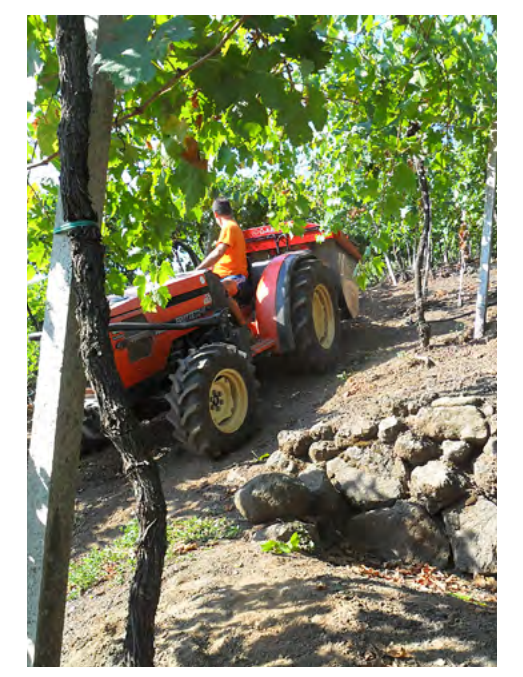
The Roccolo del Durlo vineyard: tufo, basalt and clay.

The 2013 Le Battistelle Soave Classico "Roccolo del Durlo" ($19.99) vineyard is the a mix of tufo, basalt and clay, but is so dark it's called "Le Carbonare," referring to its coal-like color. Gelmino took me out in this vineyard to show me a whole section of vines that are more than 100 years old—incredible to look at but even harder to imagine. I love this wine: the nose is full of spice, white flower and on the palate it has a certain depth—I balk at saying power, because it is so delicate, but it does have staying power and it ages very well for up to 10 years.