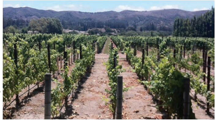
Melville Vineyards in the Sta. Rita Hills.