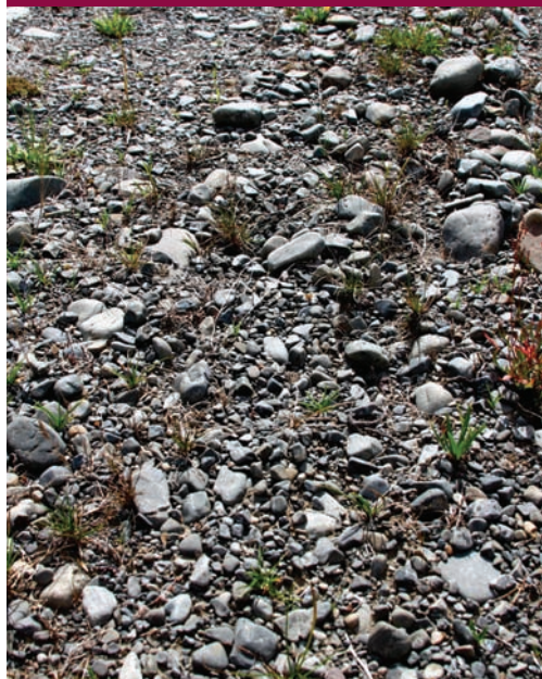
Gimblett Gravels soil.

“Mission Estate’s ‘Jewelstone’ came in third, beaten out only by Haut-Brion and Mouton. It ranked ahead of Lafite, Latour and Margaux when tasted blind by 40 of the world’s top wine professionals.”