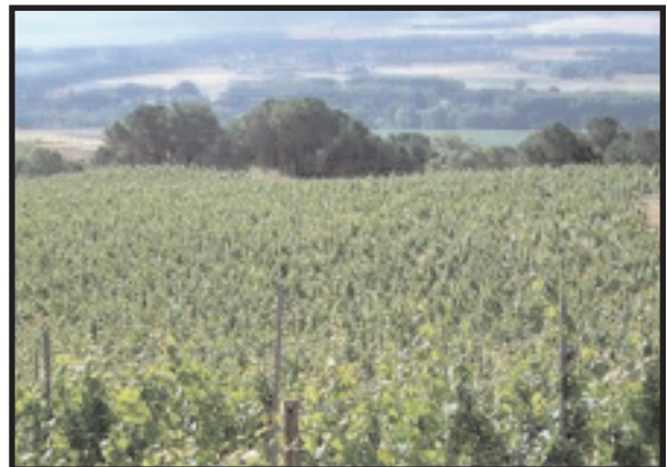
Quinta Sardonía, in Spain's famous Ribero del Duero.