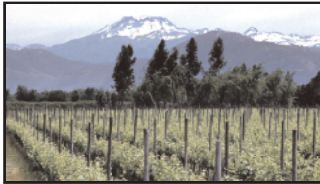
One of Miguel Torres's vineyards in Chile.

Your re-order price for this wine as a club member is $8.99.