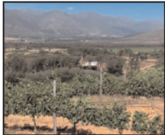
The Graham Beck winery and vineyards.