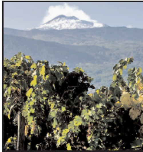
Vineyard with a view of Mount Etna.

Your re-order price for this wine as a club member is $19.99.