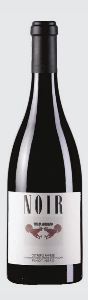
"Every April I travel to Verona to participate in the controlled madness that is Vinitaly."