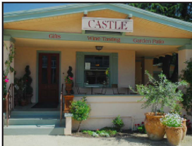
Castle Vineyards tasting room in downtown Sonoma.

This 100% Syrah has won numerous accolades, including a gold medal in the 2005 San Francisco Chronicle Wine Competition. The wine was aged for 19 months in a combination of American and Hungarian oak. The aromas have notes of black tea, berries and vanilla. The palate is rich with dark fruits, vanilla and a hint of spice. This is an outstanding choice with hearty stews and richly sauced meats. Drink now and over the next three to five years.