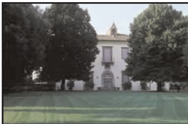
Castillione Vallis Pease, now called Castiglioni