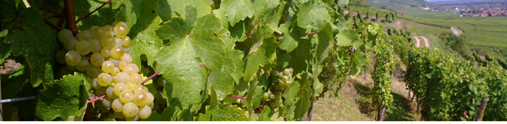
Altenbourg vineyard in Alsace.