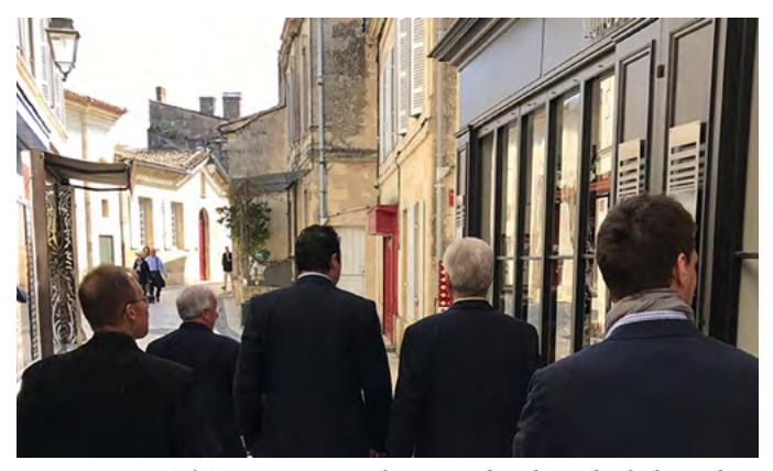
K&L's Team 2016 scouts the streets of Bordeaux for the best values for our customers...and maybe a midday nosh.

2016 Clerc-Milon, Pauillac ($69.99) 94-95 JS: "Refined and ultra-fine with a linear and polished character. Full-bodied, yet tight and racy. A classy and sophisticated young wine."