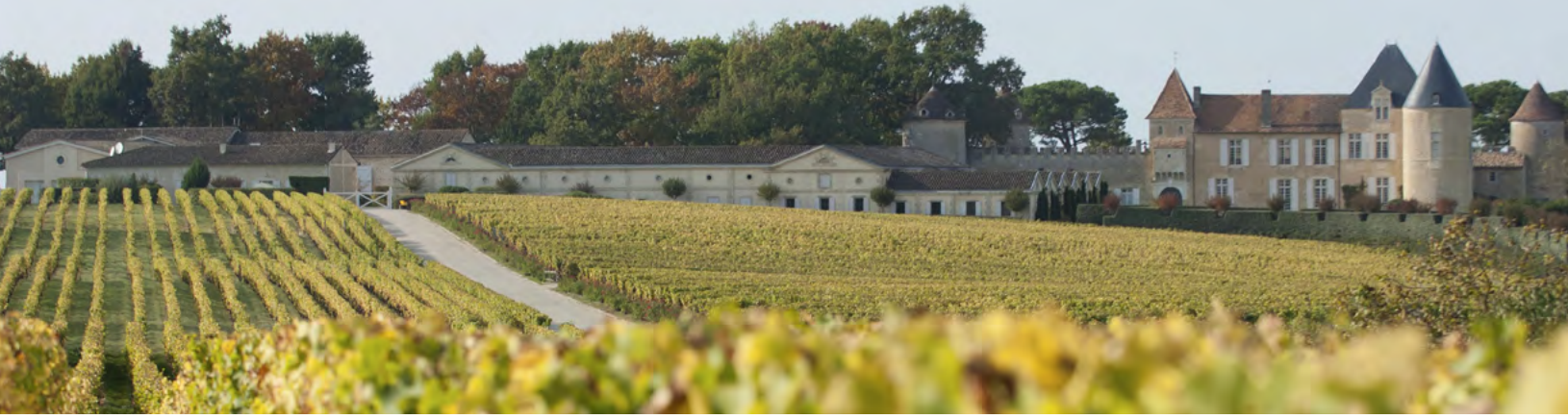
A golden autumnal hue tints the vineyards of Château d'Yquem.