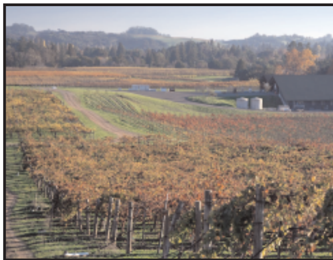
The 203-acre Hendry property, northwest of Napa.

The Hendry family has been farming its vineyards in Napa Valley since 1939. With over 75 vintages under their belt, the Hendry family has mastered the growing of Zinfandel grapes. The Hendry Ranch consists of 203 acres situated in the hills northwest of Napa, with 114 acres planted to grapes. Thanks to this large planting all the grapes that go into Hendry wines come from their estate vineyards. The Hendry Blocks 7 & 22 are located on the benchlands west of the town of Napa. These nine acres are between 230 and 300 feet above sea level and have thin, stony Boomer series soils. The maritime climate is moderated by morning fog and strong afternoon breezes from San Pablo Bay. Block 7 was planted in 1975 and block 22 was planted in 1995.