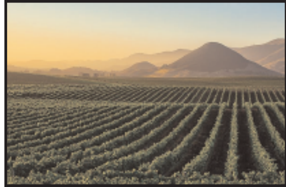
The Edna Valley A.V.A. is in San Luis Obispo County.

Area Code Wine Company says its goals are simple: to make world-class wines from the best area codes on the globe. They believe that winemaking quality begins by sourcing from the most reputable winegrowers and sites. They strive to make wines that speak honestly and clearly, true to their site, true to style and true to the passion and pursuit of their winemaking team. The vintage rotary phone on their label embodies the values of Area Code Wine Co. It speaks of a simpler era, before e-mail, voice mail and texts, when people made the time to stop and authentically connect with friends and family. The idea is, honest wines creating honest and authentic connections.