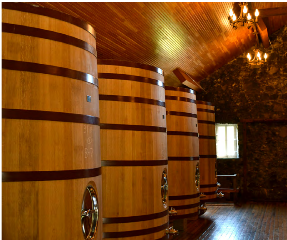
Oak upright tanks on the second floor of historic Heitz Wine Cellars.