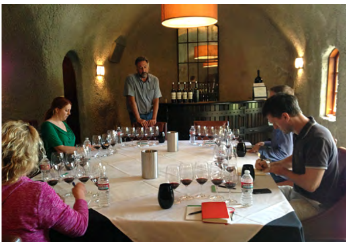
Hard work at Pine Ridge: taking tasting notes.