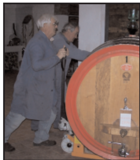
Poggiarilino Brunello on the move.