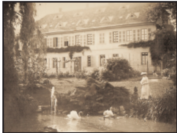
The Sektkellerei Fitz in 1899.

Your re-order price for this wine as a club member is $12.95.