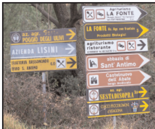
This way to Sesta di Sopra!

Your re-order price for this wine as a club member is $13.99.