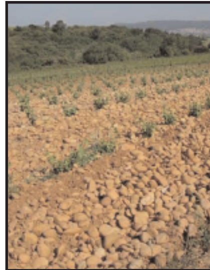
Vineyard at Domaine Duseigneur.

The ancient alluvial terraces of the Rhône are made up of red clay and stones on top of a layer of sand. The vineyards resemble an ocean of stones. These stones are a fundamental component of the terroir. They help to hold moisture in the soil, allowing the vines to withstand long periods of drought. They also preserve the soil's most fertile surface layers, which otherwise would be washed away by the heavy autumn rainfall. Most importantly, the stones trap the heat of the sun during the day and release it during the night, promoting the healthy growth of roots and grapes alike. The vineyards of the estate are planted on hillsides in a north-south orientation, enabling them to resist the relentless assaults of the Mistral wind. Le Mistral, which means "Master" in the local dialect, is hot and dry during the summer and bitterly cold during the winter. It dominates the whole lower Rhône Valley. In this unforgiving environment, only the vine has been able to withstand the Mistral. But the Mistral is not just a malevolent force; it is also responsible for the exceptional level of sunshine in the valley, which hastens the maturity of the grapes and gives them an extraordinary concentration.