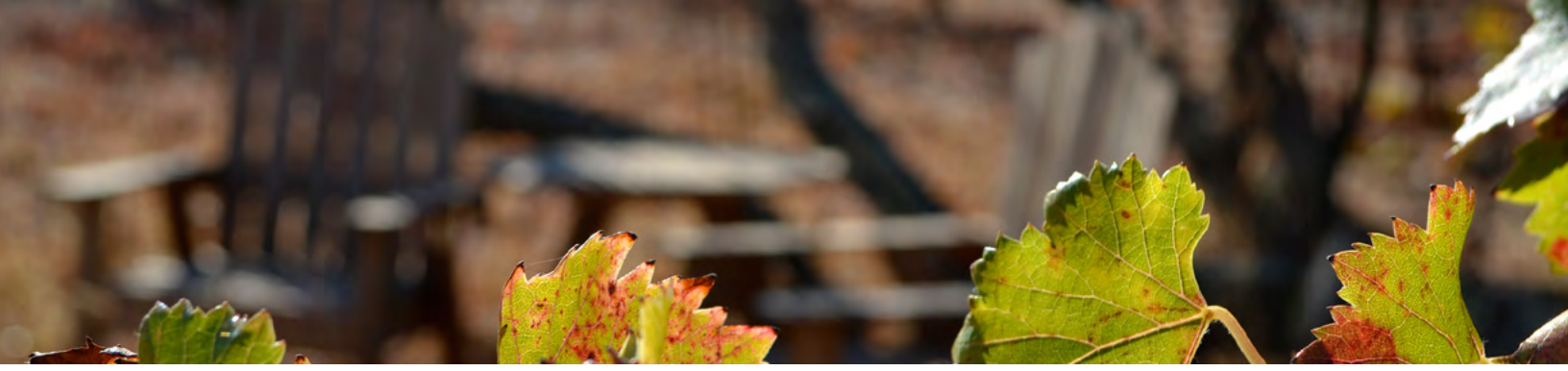
Autumnal vignette: any table will do.