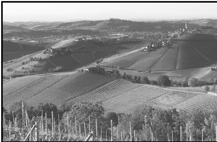
Barbaresco, a small village, sits on a hill overlooking its vineyards.