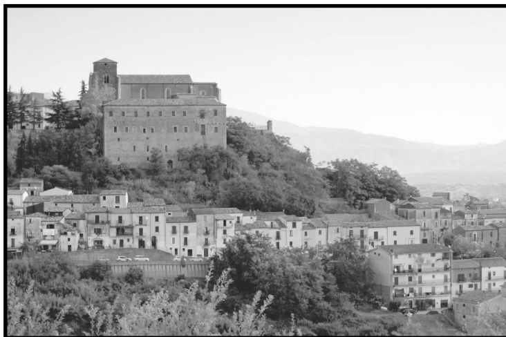
The town of Saracena sits high on a hill overlooking the plains below.