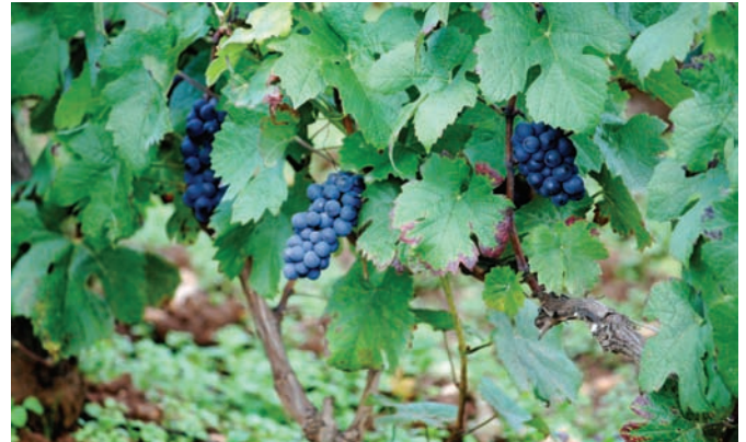
Burgundy vines.