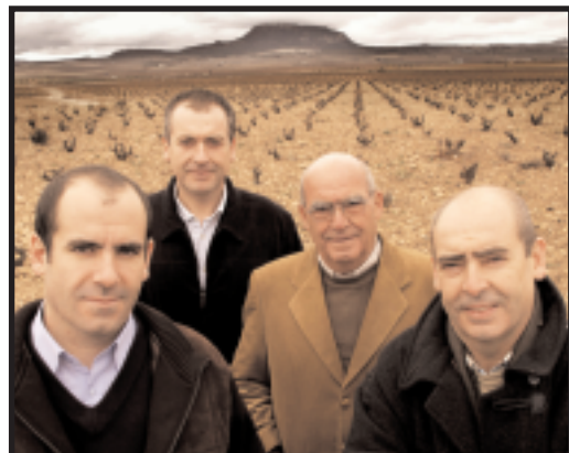
The Castaño family at Bodegas Sierra Salinas.