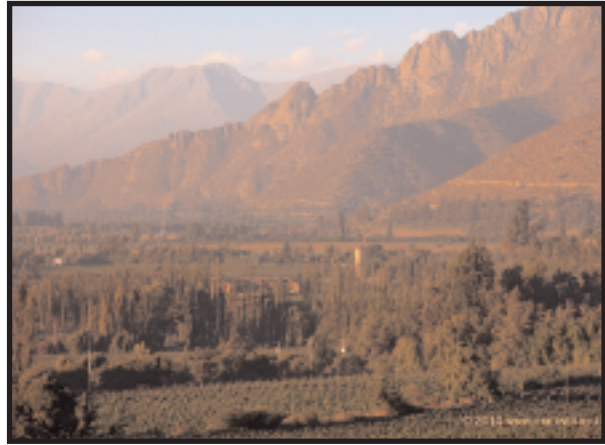
Vineyards in the Aconcagua Mountains.