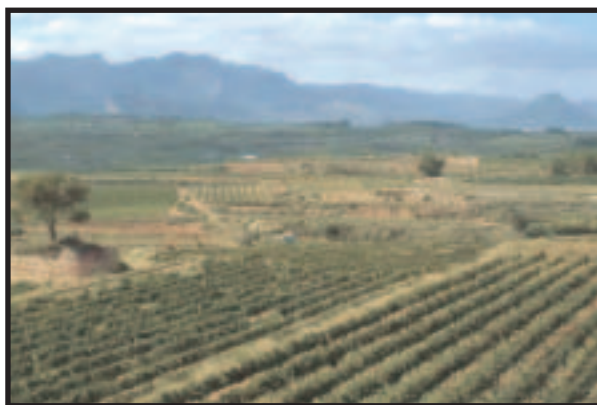
The Edetària Vineyards in Terra Alta, Spain.

Terra Alta (High Land) is situated in rolling hill country of great beauty, captured evocatively by Picasso in paintings when he spent summers there. Here in inland, southern Tarragona, low mountains, rolling hills and valleys run south to the border with Teruel province. The wine region's main town is Gandesa, where the topsoil gives way to limestone and clay, low in organic content, with a significant proportion of larger elements that give good aeration and drainage. The