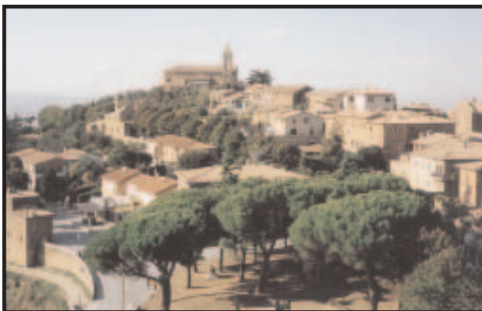
The Tuscan hill town of Montalcino is a great place for wine lovers.

Montalcino is in the southern part of Tuscany, a little more than an hour's drive south from Florence, and it is a sleepy hill town. It doesn't have dozens of churches filled with precious art works; its one major historical piece of architecture, "La Fortezza" (the Fortress), now functions mostly as a wine bar. The growth of wine tourism and a sudden boost of publicity generated by Wine Spectator —and increasing wine quality—have made this Tuscany's hotbed for wine.