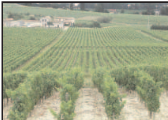
A Bordeaux vineyard.

The wine has a nice, expressive nose with elegant notes of red flowers. On the palate, it is a supple, medium-bodied wine with nice balance and a lovely roundness from the Merlot and a bit of structure from the Cabernets. This is a great wine for the table and is priced for everyday enjoyment. This is real, honest wine and a pleasure to drink. It will go well with red meats and hard cheeses. You can enjoy it now or put it in the cellar for another three to five years.