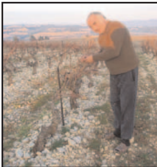
A vineyard at Domaine La Soumade. Note the size of the rocks, typical of this area.

One of the finest wines produced at La Soumade is the Rasteau Cuvée Confiance, which is only made in the best years. The wine is 80% old-vine Grenache, with 10% Syrah and 10% Mourvèdre from some of the oldest vines on the estate. Parker gave this blockbuster 92 points, writing, "The 2003 Cuvée Confiance Rasteau ratchets up the quality level. It boasts raspberry and crème de cassis notes interwoven with notions of espresso, scorched earth, and figs. Full-bodied and ripe, with high alcohol as well as a heady, layered personality revealing huge levels of fruit, glycerin, and alcohol, it should drink gorgeously for 12 to 14 years." ( Wine Advocate #163, February, 2006).