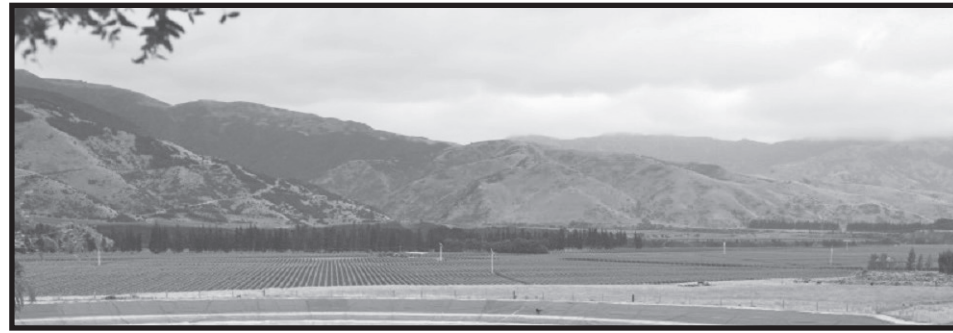
Planted to Pinot Noir, Pinot Gris and Sauvignon Blanc, the Kuranui vineyard sees very hot days and very cool nights. Good for the fruit, and challenging for the vineyard managers.