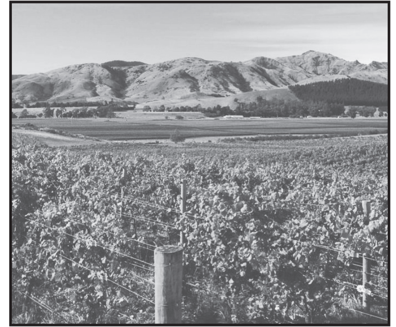
Fromm Vineyards is located in a premier area of Marlborough.