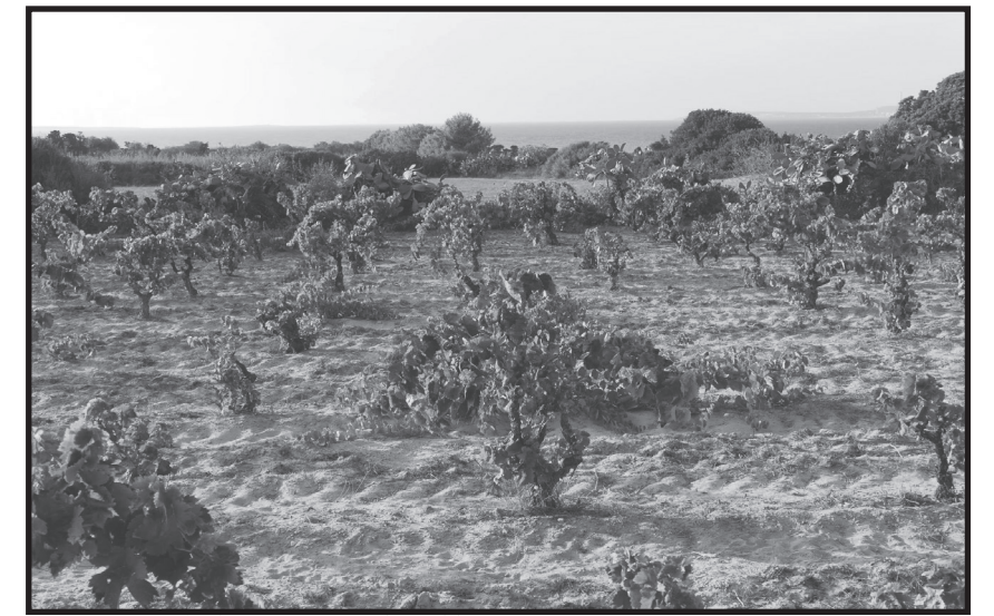
Vineyard on the beach, Tenuta la Sabbiosa, Sardinia.