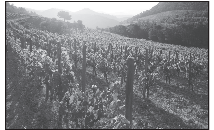
The vineyards of Château la Croix des Pins in Gigondas are planted on steep slopes in the heart of the Montmirail Dentelles.

Our second wine hails from Margaret River, Australia. I love this region, and its classically