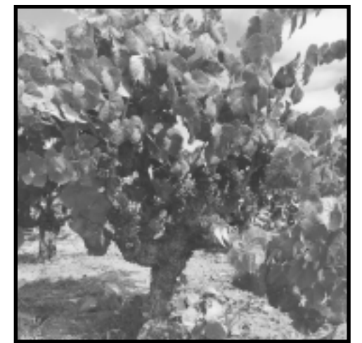
The ancient bush vines of Mancini Ranch produce incredibly layered and complex berries.