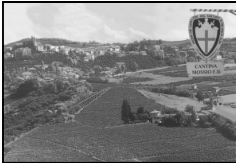
The view from the Mossio Winery.

In the botany of grape varieties, ampelography, a lot of things have been cleared up thanks to DNA analysis. You'll notice I say "a lot of things," not everything. It seems grapevines are a really mixed-up bunch of plants. Refosco is not related to Mondeuse. Just across Italy's eastern border on the Slovenian-Croatian border is a grape called Refosco dal Peduncolo Verde. What? That's right, but maybe we should talk about what a Peduncolo or Peduncle in English is. The Peduncle is the stem that connects the bunch of grapes to the vine. It seems that there are red stems and