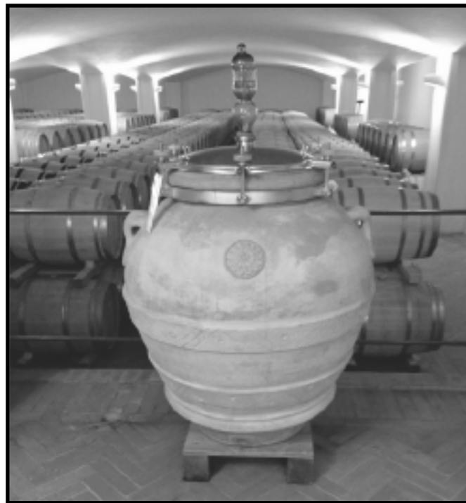
One of the most intriguing aspects to this month's Sauvignon Blanc is the combination of vessels used in winemaking. The winemakers use traditional barrels and also amphorae, stainless steel, and concrete.

Our second wine this month is the 2018 Kalinda Napa Valley Sauvignon Blanc ($12.99) . It's rare now to come by Napa Valley Sauvignon Blanc for less than $20, but one with such a pedigree and at $13? A deal not to be missed! Napa Valley Sauvignon Blanc, rather like Sancerre, is a style unto itself. Classically, this type of wine was labeled in California as "Fumé Blanc" and typically, some aging in oak lent a creamy texture to the wine. While the term Fumé Blanc has become rarer in these days of transparent wine marketing, the style remains. In this case, the producer has elaborated upon the classic oak-aged style by supplementing several other vessels into the mix, then blending to taste. Perhaps the most remarkable aspect is the use of Acacia wood. That too is an old tradition in winemaking, and the wood gives an elevated aromatic quality to the finished product. This wine certainly does have beautiful aromatics, with a creamy palate loaded with fresh white pear, citrus zest, papaya and passionfruit. It drinks so effortlessly, I don't doubt it will quickly become a house staple for you, as it has for me.