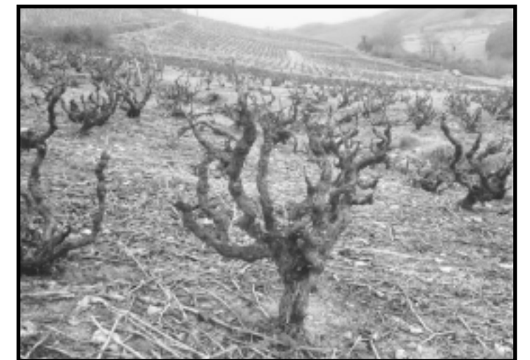
The old bush vines that Jean-Michel Dupré chooses to work with take lots of maintenance. Here they are seen in their bare winter glory.