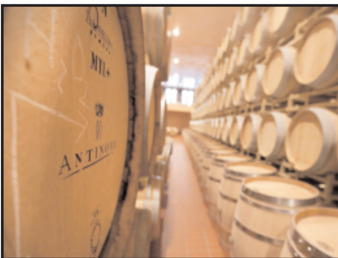
In the cellar at Guado al Tasso, you can't miss the Antinori name.