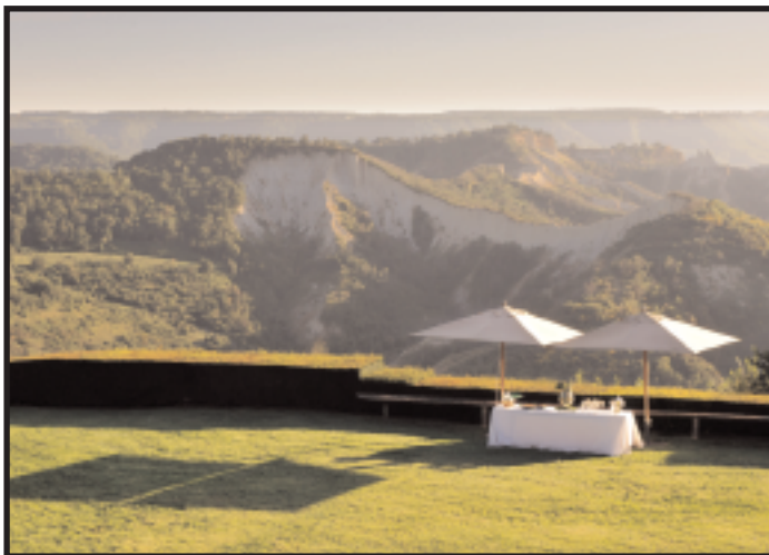
D'Amico winery has a dramatic setting near the town of Orvieto.

The town of Orvieto is a short drive away from the north end of the D'Amico property as it reaches briefly into Umbria's DOC of Orvieto. The 2015 D'Amico NOE Orvieto is based on the indigenous Grechetto blended with Trebbiano and a bit of Pinot Grigio. You can tell from the start that the wine is special. The nose smells a bit like an apple pie, those sweet apple aromatics with cinnamon and toasted crust. Yet once the wine is on your palate you'll stop thinking of dessert because the wine has a savory character with hints of sage and a bit of saltiness to go along with concentrated pear and zesty citrus. The finish leaves you with the sense that you've just had a real wine; it's alive and lifts at the end. I like this wine so much that I started thinking about making some Chicken Schnitzel to go with it. You should too!