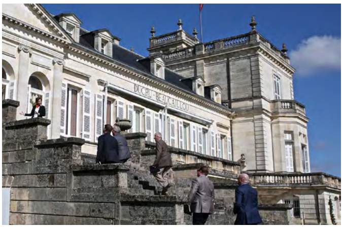
The team is ushered into the great Château Ducru-Beaucaillou