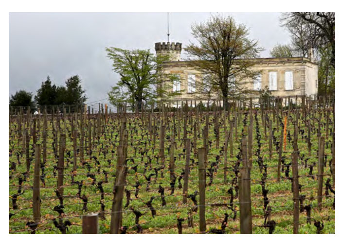
The Merlot vineyards of Château Barde-Haut in St. Emilion

There are a lot of good wines on the Right Bank in 2015—but there is not a large supply of those wines available!