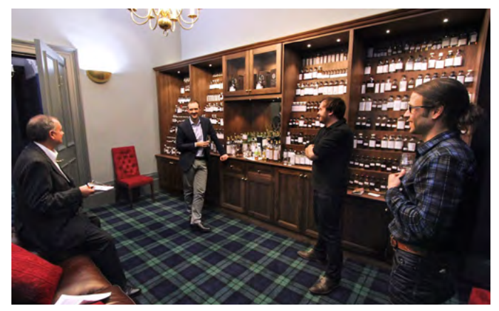
Tasting at Hepburn's Choice.

Today, the boutique market has changed a bit. More than ever before, whisky customers want to know where their whisky is coming from and who actually made it. That's forced blending houses to rethink their strategies a bit. In today's market, where knowledge and information are valued, would it perhaps be more beneficial to bottle these numerous casks from numerous different distilleries as individual whiskies rather than nondescript blends? That was a question that various blending houses began to ask about 15 years ago, and the answer to that question was a resounding yes from