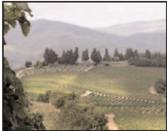
Vineyards at Querciabella.

The 2007 Querciabella Mongrana, the third vintage of wine from Querciabella, is a blend of 50% sangiovese, 25% cabernet sauvignon and 25% merlot. It is a gorgeous and fruit-forward example of what