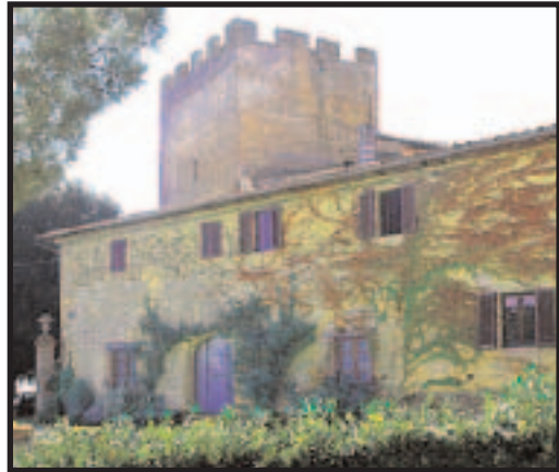
Tenuta della Luia.

Your re-order price for this wine as a club member is $23.99.