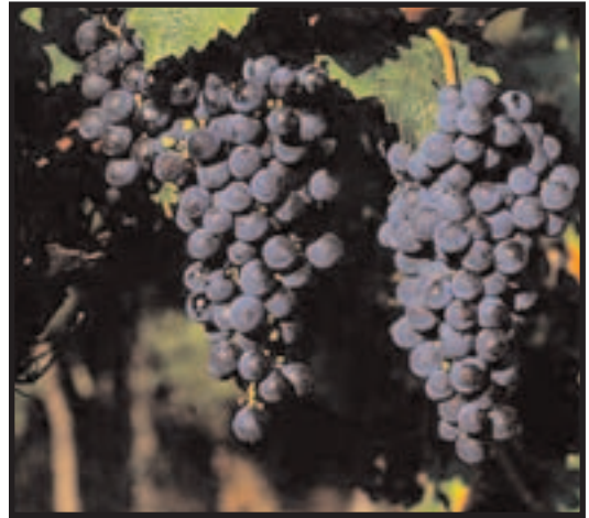
Cabernet Sauvignon grapes.

The 2008 Kalinda Cabernet Sauvignon Napa Valley comes from a small winery that has been getting more and more favorable press lately and should be producing great, affordable cabernet sauvignons for years to come. This wine has a hedonistic nose of black cherries and plums along with notes of chocolate. The palate is a deft mix of dark cherry, chocolate and smooth, mocha-laced oak. This wine is so plush and approachable you can almost finish a whole bottle without realizing it. Enjoy it with your favorite cut of red meat or when you're craving a smooth glass of red wine. You could wait and let this sit in your cellar for a year or two, but why wait when it is drinking this well right now.