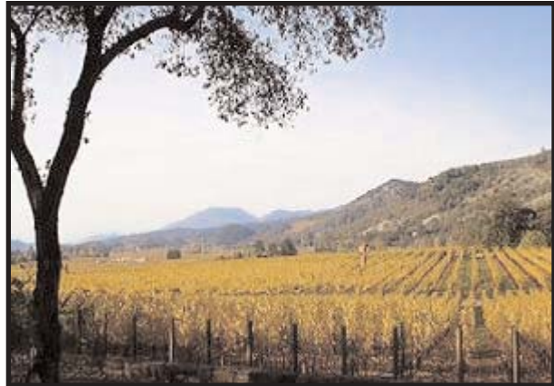
A vineyard in the Napa Valley's Rutherford area.