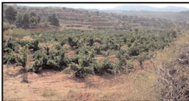
Terraced hillside vineyards in the Priorat region of Spain.

An ancient wine-growing region where vines were first planted in the 12th century, Priorat has a desolate beauty with ancient terraces climbing the stony hillsides. Legend has it that a local shepherd had a vision of angels climbing to heaven as if on a staircase. The Carthusian monks established a monastery or "priory" on the spot, which was called Priorat de Scala Dei, the Priory of the Staircase to God. The monks naturally made wine and although the original monastery is in ruins today, the winemaking continues.