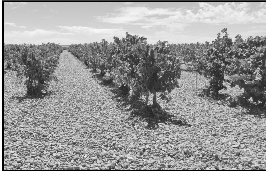
The gravelly soils of Rueda are poor in nutrients, forcing the vines to dig deep into the earth for sustenance, and the soils also provide great drainage for the vineyards.