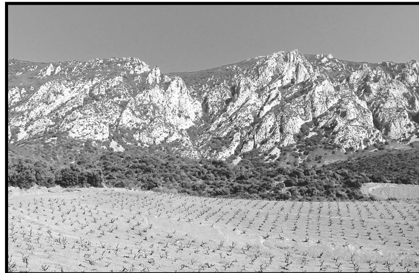
Gilles Troullier's "Boreal" Syrah comes from a unique, half-hectare plot of head-trained Syrah vines planted in granitic soils.