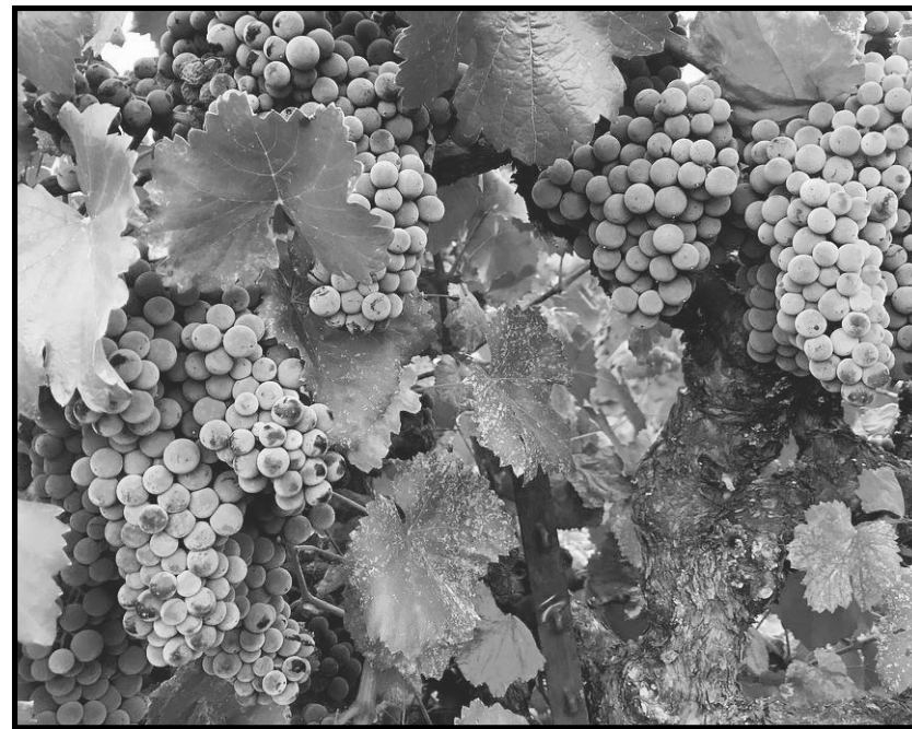
Renwood vineyard is home to some very old Zinfandel vines, some of which are head trained. They grow more like bushes than traditional trellised vines.