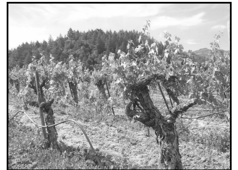
The ancient, gnarly vines at Romeo Vineyards produce incredible, intense fruit with small, concentrated berries that pack a big punch.

Our second wine comes from one of my favorite wineries in New Zealand. Known more for its Pinot Noir and Sauvignon Blanc, New Zealand actually produces incredible wines of every stripe. In Hawke's Bay, where Trinity Hill is located, the warmer climate is particularly suited to producing bigger reds such as the Bordeaux and Rhône varietals. This month's 2016 Trinity Hill "Gimblett Gravels" Syrah Hawke's Bay ($22.99) is the most stunning Syrah I've had this year. The Gimblett Gravels region