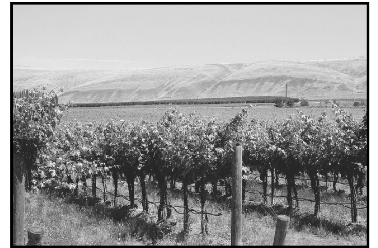
Washington's Columbia Valley is home to a surprisingly large number of AVAs. Wahluke Slope in particular is known for top-notch Cabernet.

Island" series, and is a stunning Cabernet, blended from three of Washington's premier vineyard sites. The grapes for the 2016 Ryan Patrick "Rock Island" Columbia Valley Cabernet Sauvignon ($14.99) hail from the Wahluke Slope, Rattlesnake Hills, and Red Mountain regions of the Columbia Valley. The team at Ryan Patrick uses fruit from each of these AVAs to achieve a beautiful blend, representing the best of Columbia Valley Cabernet. The wine was aged in 20% new American Oak barrels for 18 months, and then blended to taste and bottled. It is just now coming into its own with rich cassis, prominent blackberry leaf, cedar and tobacco notes. On the palate it is silky smooth with unctuous black fruit and latent savory tones. It's a perfect example of the excellence this region can achieve.