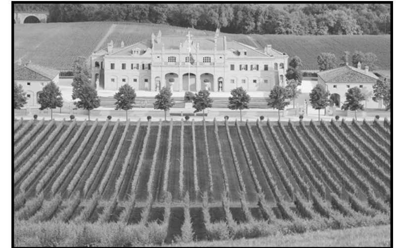
The magnificent Pollenza winery, at the center of the 530-acre estate.