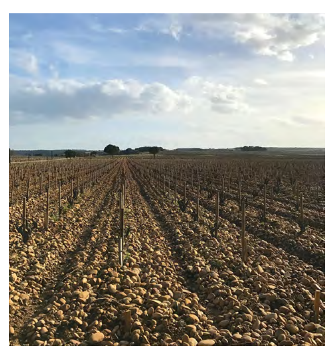
CdP: Rock on.

Just outside the town of Châteauneuf-du-Pape lies Chateau Vaudieu. The original house is a stunning restoration of a castle built in the 18th century, one of only three still in existence. The property itself is historic, and their next door neighbor is none other than Chateau Rayas, one of the icon cult producers in the region. Some of Vaudieu's best vineyards have much of the same decomposed sandstone soils that make Rayas so famous. The regular 2017 Châteauneuf-du-Pape (PA $44.99) is a blend of Grenache, Syrah and Mourvèdre, from a mix of soils including red clay, limestone, and of course that beautiful decomposed sandstone. The wine demonstrates a wonderful elegance, showing more of its fresh fruit nature than the concentration of some of the other releases. It's a wonderful wine of purity. 90-92 JD