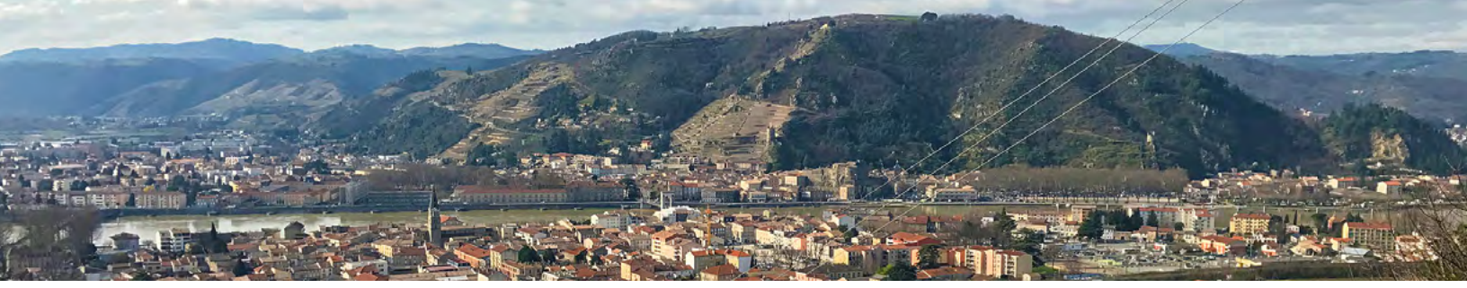
All quiet on the western bank: Looking toward Saint-Joseph across the river from the hill of Hermitage