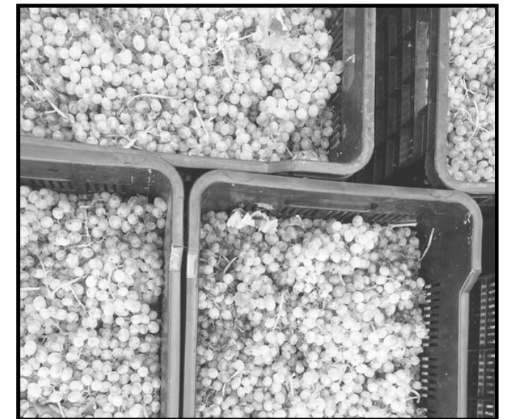
Chenin Blanc, while best known in its French expression, Vouvray from the Loire Valley, is one of South Africa’s most planted varietals. Thinus likes to use the rich powerful fruit from older Chenin Blanc vines whenever possible.

We’ve been attracted to Corsican wines for a while at K&L, and have come across a handful of