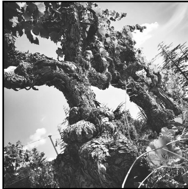
The term "old vine" takes on a whole new meaning at Domaine des Bosquets. Current proprietor Julien Brechet takes great pride in these ancient Grenache vines, whose powerful fruit lends extra dimension to the wines of Bosquets.

Our white is a beautiful Riesling from Domaine Schlumberger, from the "Saering" Grand Cru near the town of Guebwiller. Saering is a unique Grand Cru of Alsace in that it extends at a gentler slope into the plain and sits on a calcareous limestone deposit, covered by sandy soils. This location gives the fruit a strong saline and mineral quality. Riesling is the preferred varietal for this site, which produces rounder, softer wines than those of the neighboring Grand Cru site Kitterlé. The 2015 Schlumberger "Saering" Riesling Grand Cru Alsace ($29.99) is dry, poised and highly aromatic, while maintaining this beautiful palate weight. Winemaker Alain Freyburger uses ancient oak casks for some of the fruit lots for the Grand Cru Rieslings. These casks are so ancient that they no longer impart any oak flavors, but do allow for