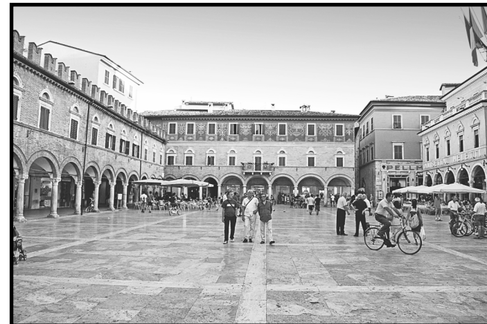
The Piazza del Popolo in the southern Marche city of Ascoli Piceno.

it's the opposite. The Marche is one of my favorite places in Italy. It reminds me of what Italy was like 40 years ago, unspoiled. You won't meet your neighbors there by chance, or for that matter any non-Italian tourists. The Marche is roughly the other side of the Apennine Mountains from Tuscany, and has a narrow coastal slope that gives it a smallish feel. There are two important red wines from the Marche. One is Rosso Conero, coming from just outside of the port city of Ancona and named after the Conero National Park. Its blend is 85% Montepulciano and 15% Sangiovese. The other, Rosso Piceno, takes its name from a beautiful city in southern Marche called Ascoli Piceno. Its blend is more flexible: 35% to 70% Montepulciano and 30% to 50% Sangiovese. A couple of months back we had the Tenuta Santori Passerina, an intriguing indigenous white variety. We're coming back this month with the 2015 Tenuta Santori Rosso Piceno ($15.99) . This bold and fruit-filled wine is a blend of 65% Montepulciano and 35% Sangiovese. To preserve more of its fruit character the wine is fermented in 80% stainless steel and 20% barrique for four to six months. This is a wine that cries out for grilled meat.