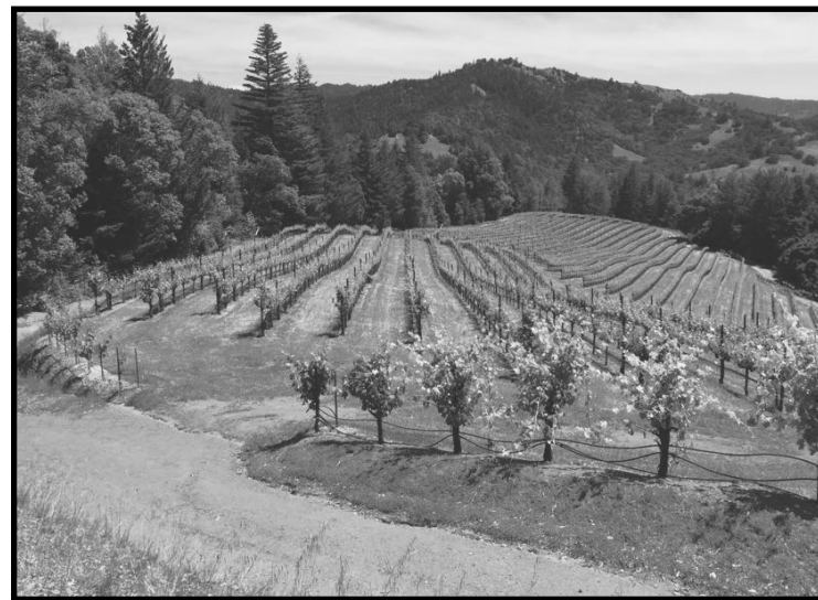
The Perli Vineyard on Mendocino Ridge has great exposure to cooling winds, preserving acidity in the Syrah fruit and keeping it in balance.