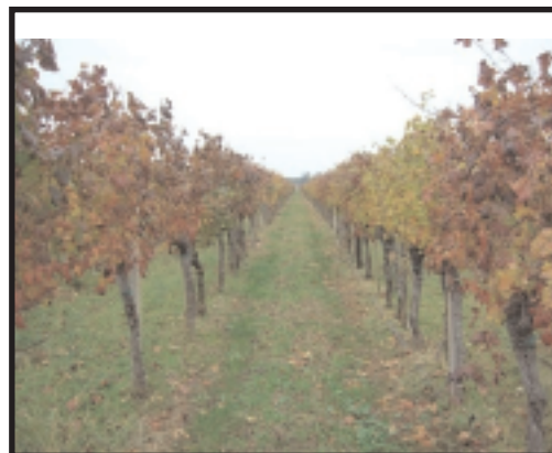
Vineyards at Blason winery, in Friuli.

Friulian red wine is sometimes a challenge, for most Americans; Friuli's long, cool growing season leaves the red wines with a leaner, sometimes greener texture and flavor profile. The Friulian region has a not-so-flattering nickname in the rest of Italy; they call it the Pisciatoio of Italy, "the Urinal of Italy" because it rains, rains and then rains more and then a little more. That's not the greatest formula for red wine. It took me a while to understand and then get used to the flavors; it is easy to like sweet, ripe flavors but that edgy herbaceousness took some learning. Hey, I didn't like brussel sprouts, asparagus or mushrooms as a kid either. Cabernet Franc has been growing in this part of Italy for more than one hundred years. During that time some of the "Cabernet