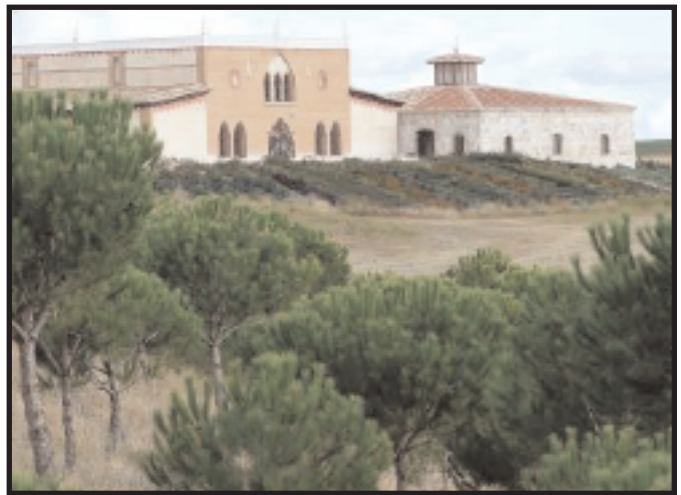
Bodegas Gotica, where the Trascampanas Verdelho is made.

Trascampanas is made by Bodegas Gotica, a family-owned domaine that has been growing grapes in Rueda for four generations. Their estate has 240 acres under vine, 90% of the plantings being Verdelho grapes, which achieve their maximum potential in Rueda's ideal soil. The stony brown soils of Rueda are rich in calcium and magnesium and easy to till; they have good aeration and drainage with limestone outcrops. The micro-climate features cool sea breezes. Bodega Gotica's renowned vineyards of La Oliva, Valdelamoza, Los Obispos and Canada Moyorido are some of the finest sites in the Rueda for growing Verdelho. The vines that produce the grapes that go into the Trascampanas come from these vineyards, and the average age of the vines is over 50 years. The vineyards are all hand-picked at night when the acids are at their highest levels and the vines are at optimum fruit-bearing levels. Bodegas Gotica is truly committed to and concentrating on making the best possible Rueda.