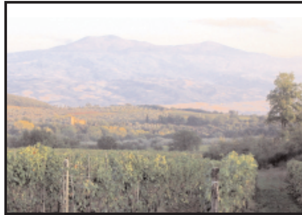
Vineyards at Baccinetti, in Montalcino.