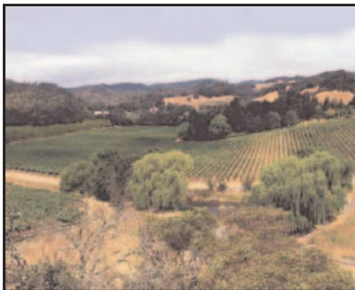
Anderson’s Conn Valley Vineyards, located in St. Helena, Napa Valley.

If you have had the good luck to try a wine from Anderson’s Conn Valley Vineyards, then you know what I mean. The wines are known for their precise fruit, impeccable balance, terroir-driven feel