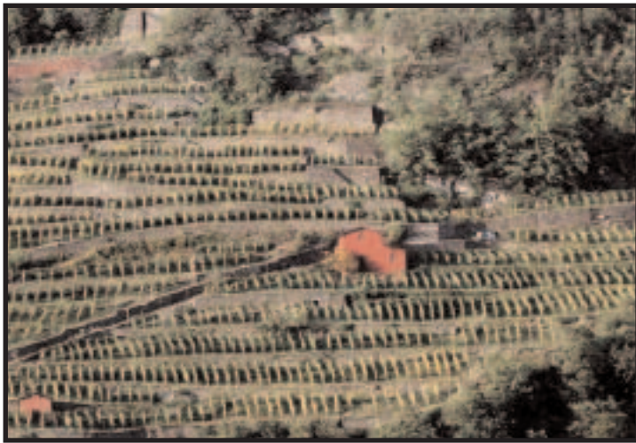
Terraced vines on steep slopes in the Grumello area of the Valtellina.

The 2007 Mamete Prevostini “Grumello” Valtellina Superiore is a rich, supple and warm wine with lots of sweet fruit and complex, wild-plum aromatics that are supported by a solid yet smooth tannic structure. The really intriguing trait of this wine for me though is its lingering finish, where layers of complex fruit reveal themselves one after the other. Grumello is one of the Valtellina’s three best known zones, along with Inferno and Sassella. The wine has only an eight-day maceration time and then a year in used barriques, but it still shows loads of character. When I think of the Valtellina I always think of Pizzoccheri , the classic dish from