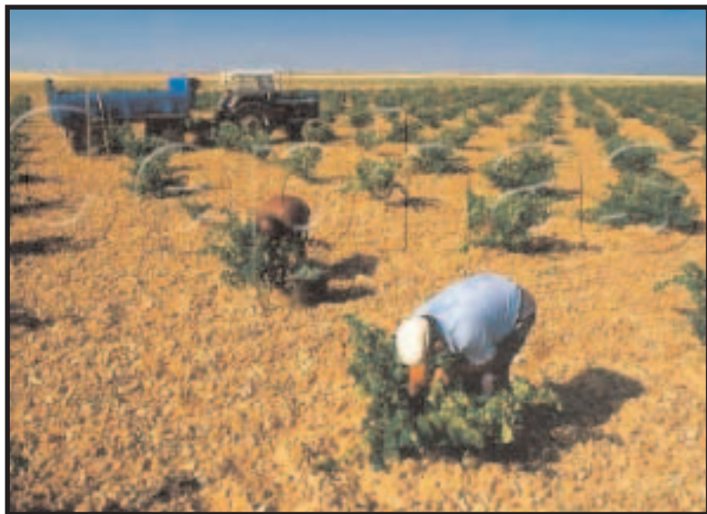
Workers harvesting Verdejo grapes in Spain.

The “ABC” (Anything but Chardonnay) movement has started to slow down but has left us with some very positive results. People started to look outside of Chardonnay when they wanted a white wine. All of a sudden new white wines were everywhere from Italy, Spain, Germany, Alsace, the Loire Valley. Many of them provided a more crisp and zesty alternative to the rich, tropical notes of Chardonnay. While it is hard to beat a fat, sumptuous, layered Chardonnay, at many times they don’t match the food you are eating or your particular tastes at that moment. Many white varietals offer up flavors of citrus fruits, floral aromas, notes of honey and mineral notes that Chardonnay just can’t seem to provide.