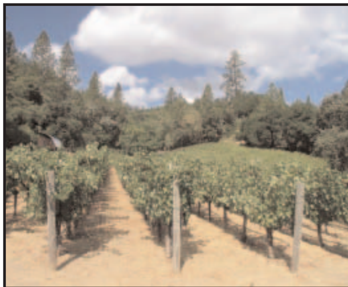
One of the Ruston Family Vineyard properties in Alexander Valley.

Your re-order price for this wine as a club member is: Please Inquire.