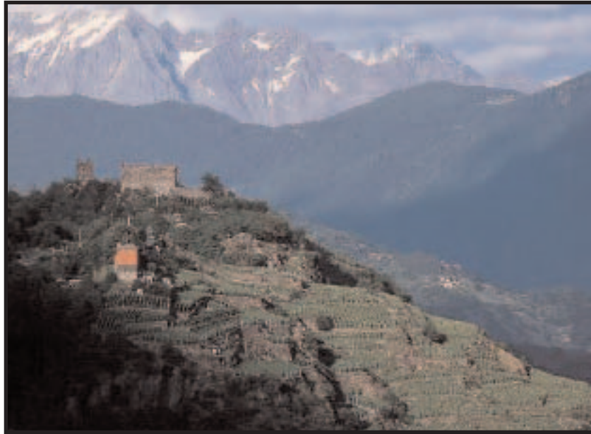
Vineyards in Northern Italy’s Valtellina region have a spectacular Alpine backdrop.

The first time I ventured into the Valtellina I was completely surprised and fascinated by what I saw. I was speechless or just kept saying “Wow” over and over—I’d never been to a wine region like this before. Italy’s northern border with Switzerland is just a couple of hours north of Milano. Here on the southern face of the Alps are thousands upon thousands of rock terraces filled with grapevines. Building these terraces must certainly have been one of the tasks of Hercules, and coaxing wine out of this difficult growing zone seems even more amazing. The Chiavenasca grape was planted here centuries ago. It has for a generation or two been generally thought to be Nebbiolo, but the locals only recently started calling it Nebbiolo, when DNA studies confirmed it. The Nebbiolo grown in this region doesn’t usually have the same power as those from the Langhe hills, but it does have the purity, elegance and above all those gorgeous rosé aromatics that are so classically Nebbiolo.