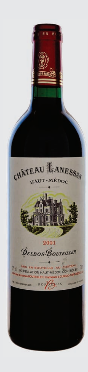
"2001 is a vintage full of elegant wines with great consistency (just like Giants pitching) that we have loved from the start."