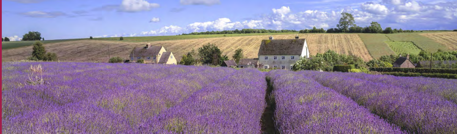
Lavender fields in the south of... England? Yes indeed, near the village of Snowhill, a short drive away from the distillery that employs the herb in their gin.