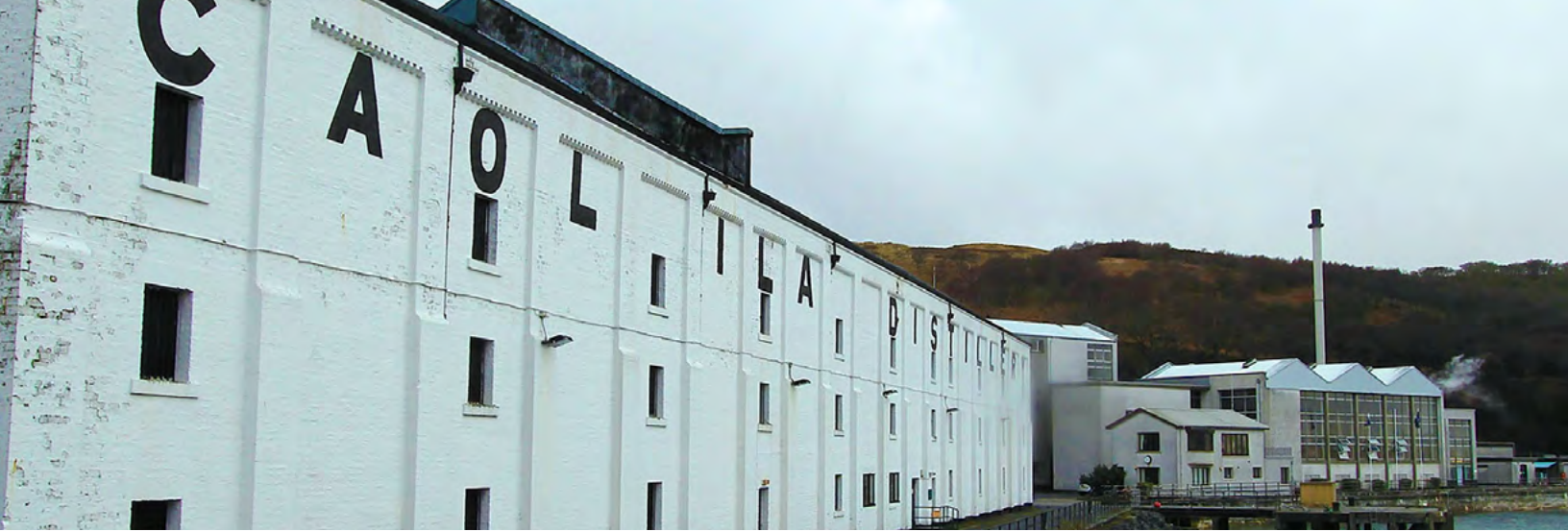
Nice day—for a warming dram of peaty, cask-strength single malt. Caol Ila during one of our before-times buying tours.

Laphroaig, ashy as Ardbeg, or oily as Lagavulin, this is fresh and vibrant, but packing plenty of peat. This is a slightly aperitif-y style, but has the stuffing to keep it interesting for any peat lover.