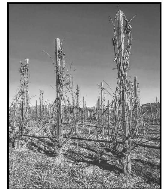
At Grimm's Bluff, roughly half of the vineyards are planted in the ancient "head-trained" method which allows more space for the individual plants and different exposure for the growing berries.