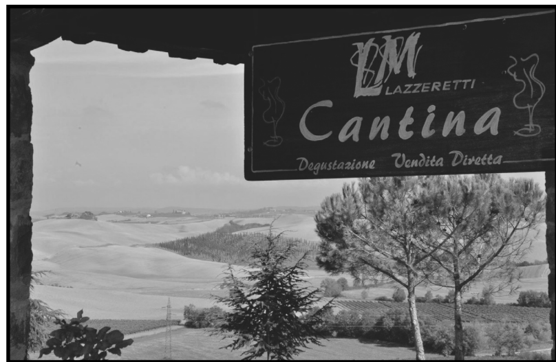
The Lazzeretti winery looking east over the Crete Senesi. They made their best Brunello ever in 2015.