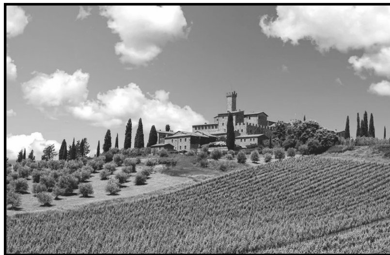
Castello di Banfi on Montalcino's southwestern slope has been one of the area's most important producers since 1980.