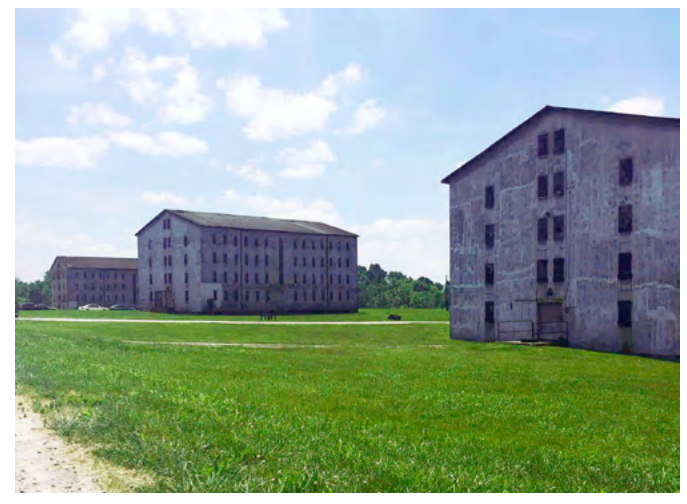
These forlorn-looking rickhouses are actually brimming with bourbon.

While the Buffalo Trace distillery and their powerhouse lineup continues to capture the hearts and minds of bourbon drinkers the world over, Kentucky is full of other great distilleries that have also spent the last decade trying to meet future demand with their proven, high-quality recipes. The Wild Turkey distillery has delivered yet again. Bottled as single barrels under the Russell's Reserve label, our two current casks offer an amazing sneak preview to three more casks coming this summer. The most common question we get whenever we bring in multiple barrels from the same label is, "How are they different?" The answer couldn't be more clear between barrels #399 and #927.