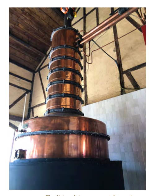
Traditional Armagnac style continues: an alembic still .

referring to a selection from a producer's many barrels in a single vintage. In traditional Armagnac production there's typically significant continuity between vintages and barrels because producers regularly blend stocks from each vintage to avoid evaporation and create homogeny. But when a supplier makes