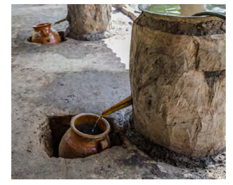
The ancient Filipino-style stills carved from the sacred oyamel trunk.

non-governmental organization designed to create value for the distillers by offering them fair compensation for the extremely labor intensive and time-consuming production. Every single dollar that goes into Mezonte goes back into the communities that