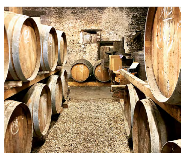
The finest chai in the Gers.

Bas-Armagnac ($129.99) The color is pure mahogany. The nose is a huge bundle of roasted nuts, dried fruits, oloroso sherry, prune purée, mocha, fig jam, clove, cinnamon. Ultra-thick and a bit hot on entry, it feels like it's going to go astringent, but backs off the edge with dense, sweet fruit, dark chocolate, burnt sugar, and exotic wood. This is a big, bold brandy that almost reminds me more of Kavalan (or something in that intensity level) than anything I've ever had from France.