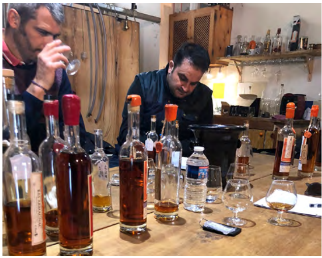
The L'Encantada team evaluates casks.

Bas-Armagnac ($139.99) This bold, masculine style Baco expresses the grape perfectly. Here we're covered in blackberry fruit compote sprinkled with pepper. The sweet-savory balance continues with roasted pecan and maple, with a hint of freshly moistened forest floor. The woodsy, almost green quality on the nose isn't quite minty, but we're close. On the palate, it's medium-bodied and surprisingly lifted for the age. Caramelized sugar drizzled over a basket of spices and underbrush. No harsh tannins, but a big, warming spice that builds to a long, sweet crescendo at the back of the palate.