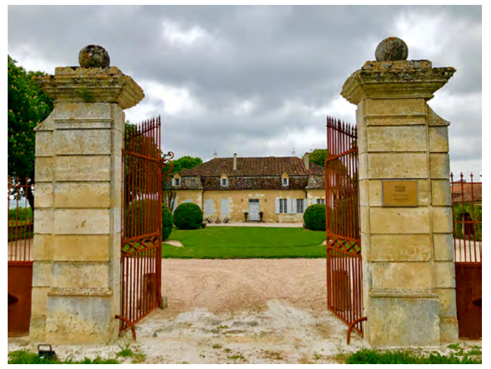
The historic Château de Vacquié in Haut-Armagnac.