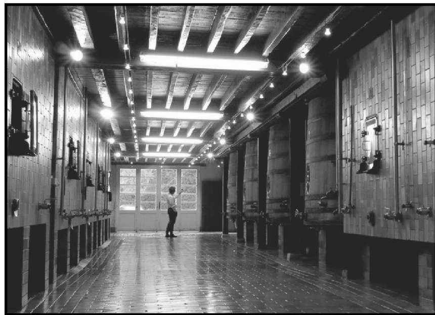
The pristine cellars of Château Poujeaux reflect the polished style of the wine.