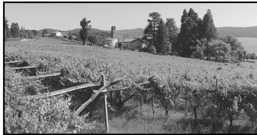
Pergola-trained vines on the Canavese Wine Road overlooking Lake Viverone.

You're probably aware of Nebbiolo from the Langhe; it's grown there alongside Barolo and Barbaresco, forever attached at the hip. The Langhe is not the only place where Nebbiolo is grown in Piedmont. Alto Piemonte up against the Swiss border hosts a myriad of DOC and DOCG appellations such as Gattinara, Boca, Lessona, Sizzano, Ghemme, Fara, Costa delle Sesia and Colline Novaresi, mostly unknown except to true Italian devotees. This month's Nebbiolo is grown in another place: the Canavese DOC, which is about