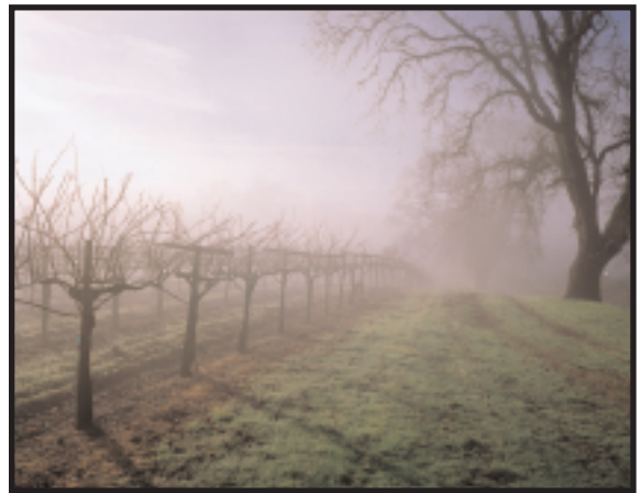
Fog in a vineyard at Iron Horse, Sonoma County.

Great choice with Dungeness Crab. Drink now and over the next two to four years.