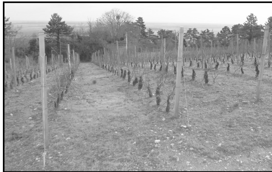
After 400 years in the business, Domaine Guy et Yvan Dufouleur own a total of 28 hectares throughout some of the best locations in the Côte d'Or.

In summer, many people gravitate towards whites or rosés, but for red wine lovers there is much to enjoy in this season as well. Zinfandels and Rhône blends can be great companions to a grill out, but when you want a glass of wine to enjoy cocktail style, there's nothing better than a classic red Burgundy with a slight chill on it. This month's 2016 Domaine Guy & Yvan Dufouleur Hautes-Côtes de Nuits Rouge ($17.99) is the ideal hot-weather red. If you serve this at cellar temperature of around 55 degrees, it's as refreshing a summer drink as