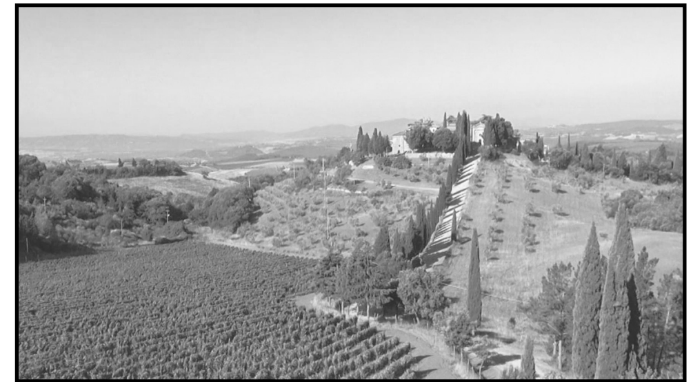
The hilltop position of the CastelGiocondo estate speaks to the long history and influence of the Frescobaldi family. The label image (below) is "Guidoriccio da Fogliano at the siege of Montemassii," a fresco in the Sala del Mappamondo in the Palazzo Pubblico in Siena.