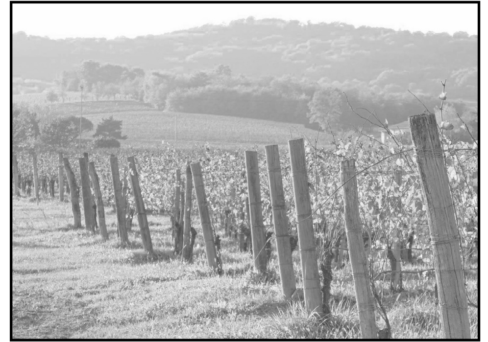
The vineyards used for the Olema rosé, in Vidauban, sport a mixture of limestone and crystalline soils that drain well and provide the ideal home for Grenache, Cinsault, Syrah and the other classic rosé varietals of Provence.

And for those of you who enjoy a glass of summer rosé, we have a great choice. This month's 2019 Olema Côtes de Provence Rosé ($11.99) is a picture perfect Provençal rose—light in color, crisp, dry and utterly refreshing. Olema wines are made by our friends at Amici Cellars in Napa, and while most of their wines are made in Napa and Sonoma, they also launched a project a couple years ago partnering with a small French estate in Vidauban in the south of France, to produce this stunning rosé. The wine opens with understated aromas of strawberry and white flowers. On the palate it has a lovely creamy texture with continued strawberry fruit. The finish is quite dry and crisp, making for a refreshing and easy-drinking rosé in the classic Provençal style. With our special club pricing, this is a deal that I don't expect will last, so I'd recommend stocking up now on this little rosé for all your summer needs.