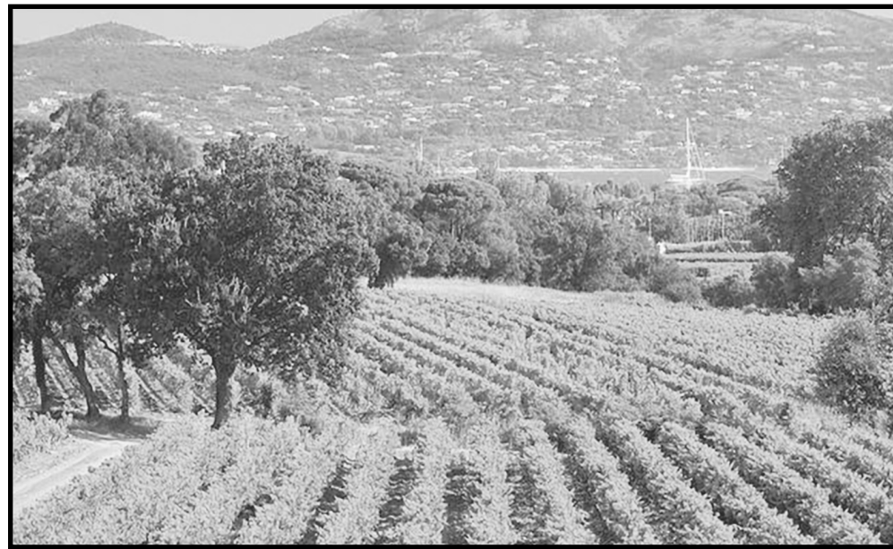
The vineyards at Château Minuty's St Tropez estate not only boast a stunning view, they enjoy an ideal climate, with the cooling influence of the Mediterranean taming the heat.

This month's white is another wine that we buy directly in France from a family-run estate, in this case Domaine de Remizières. We've previously featured some of the incredible reds from this domaine in Le Club Français, and had yet to feature a high-end white from the Rhône valley. Domaine de Remizières came through with the layered and complex 2018 Domaine des Remizières "Cuvée Christophe" Crozes-Hermitage Blanc ($29.99) . This stunning cuvée is a blend of 85% Marsanne, and 15% Roussanne from vines with an average age of 60 years. Planted on a hillside slope of clay limestone soils, the old vines lend a certain minerality to