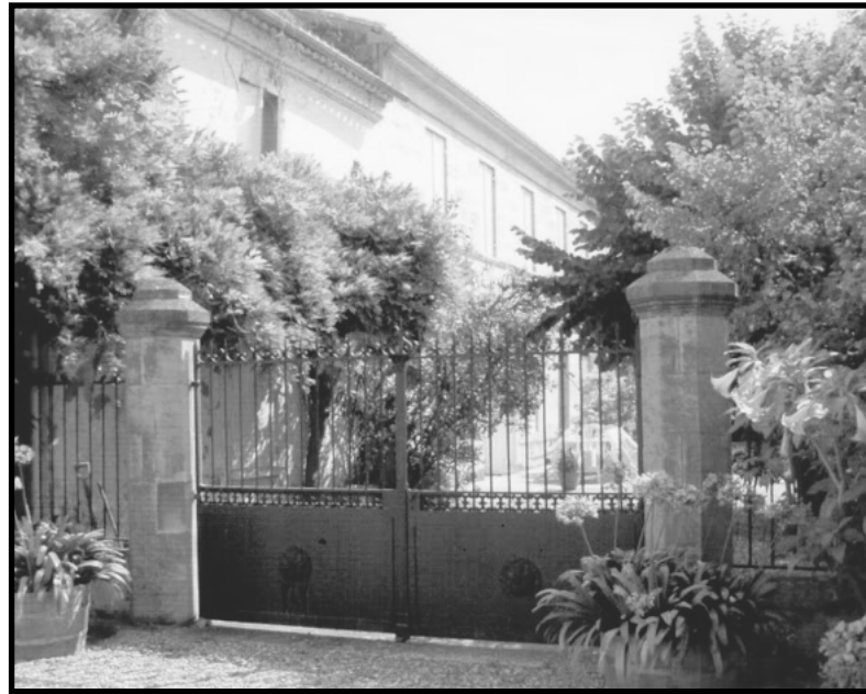
Managed by Vignoble Maynard et Fils, Valentons-Canteloup is a sister château to Bois-Malot, a perennial K&L favorite.