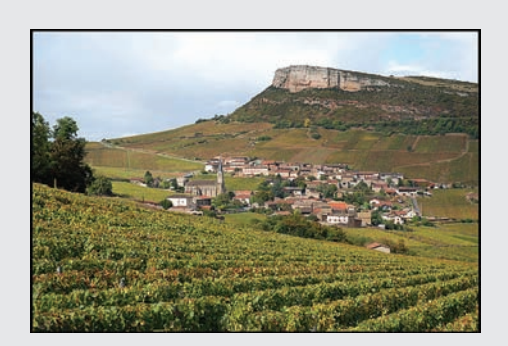
Vergisson and La Roche.

The 2009 Domaine des Nembrets "Source de Plaisirs"* used to be called Mâcon-Vergisson, but the people in charge of wine labeling in France made that name illegal since growers from the villages in the Mâcon-Villages appellation did not want any competition."