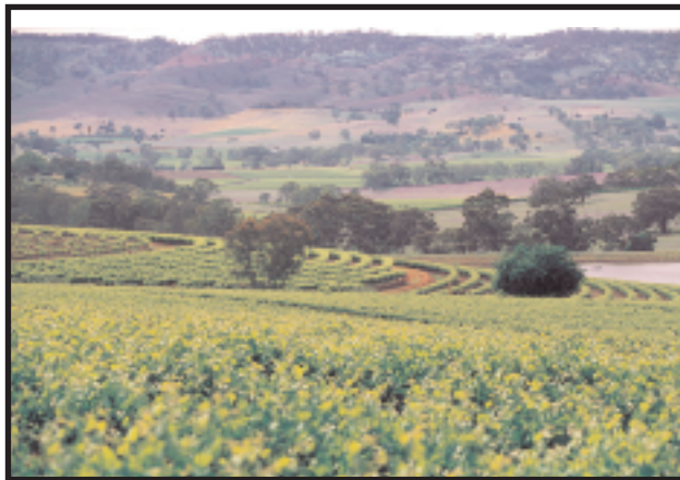
Cameron Vale Vineyard, one of the Grant Burge estates.

The fruit for this wine is grown mainly in Miamba vineyard, which is situated next to Filsell vineyard at the southern end of the Barossa, near Lyndoch. Growing conditions were excellent, allowing the varietal characters to fully develop and produce grapes of intense concentration and flavor. After crushing and destemming, the fruit was fermented in stainless-steel tanks for seven days, with temperatures peaking at 28°C early in the fermentation, then brought down to 22°C, and pumped over three times a day. The wine was partly barrel fermented using 50% new American oak, with the remainder matured for 18 months in one- and two-year-old American hogshead barrels. This wine is deep crimson and red, with rich, dark berries, cherry liquor and smoky oak on the nose. The dense fruit flavors carry through to the palate, combining with vanilla oak. Soft, balanced tannins and good acidity provide great length, with a lingering flavor of subtle licorice. Drink now with some aeration, or hold for up to ten years. Great choice with game meats.