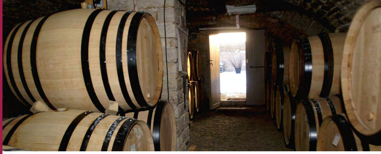
The view from the cellar of Jacques Bavard, on a past winter's day.