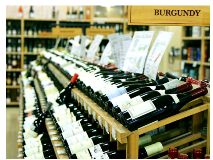
At K&L's Redwood City store, your adventure in Burgundy begins at any price point.

As we venture farther south, we come to the Mâcon, the motherland of Burgundy value. We have been lucky to establish a strong relationship with Vignerons des Terres Secretes. A cooperative much in the same vein as La Chablisienne in Chablis, they are producing extraordinary values given their capacity. The 2017 Vignerons des Terres Secretes Mâcon Verzé "Croix Jarrier" ($14.99) is a great example of the quality of the 2017 vintage for whites. Loaded with fresh citrus fruit and crackling minerality, this bright and zesty offering is a fun and fabulous Mâcon white that easily merits case purchases. 90 DC