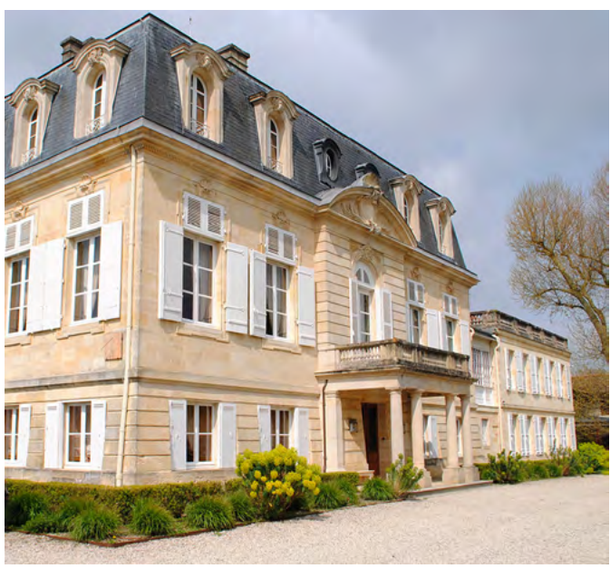
And we'll be back for more, at Château Pontet-Canet.

2006 Pontet-Canet, Pauillac ($149.99) Drinking beautifully now but with a long life ahead, the '06 is currently a dark and chewy wine with a dense mid-palate and a firm, dry finish. Lively aromas of violets and black fruits are poised and refined, yet the body is round and meaty, with substantial tannins, and a persistent finish. A huge success for the vintage.