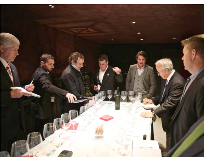
Close inspection of this photo reveals that K&L's team vintage 2016 is about to get a first taste of the Goulée de Cos d'Estournel. We still like it.