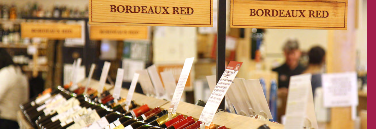
Post-holiday cheer? Got it covered, at K&L Wine Merchants, Redwood City.