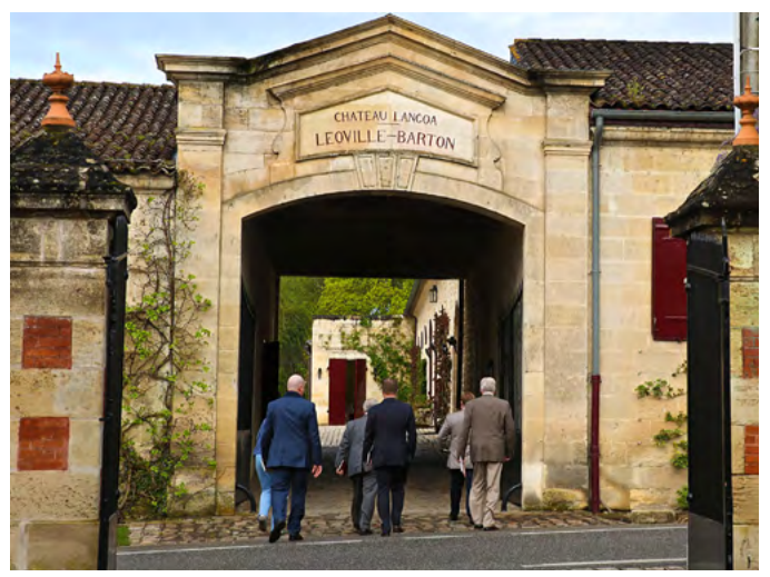
K&L's Team Bordeaux strides in the gate at Château Lagoa-Barton during the en premier campaign for the 2015 vintage.

2015 Langoa-Barton, St-Julien ($54.99) Big and balanced with bright cherry fruit in the deep middle and touches of oak, sweet berries and cola on the firm finish. Impressive now for its depth and sweetness but will age well as all that fruit is currently cloaking substantial structure.