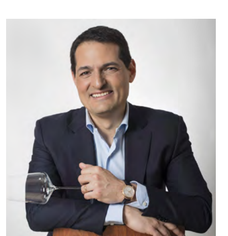
In 2013, wine critic Antonio Galloni departed from Robert Parker's Wine Advocate to launch his own wine review and media site, Vinous.

accents. A rapier finish glistens with fleur de sel details. Shows ample cut and purity. Pitch-perfect Sauvignon Blanc."