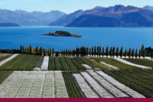
The Rippon Vineyard

"What's really at the heart of the Australian wine industry are multi-generational winegrowing and winemaking families who make wines with a sense of place and character."