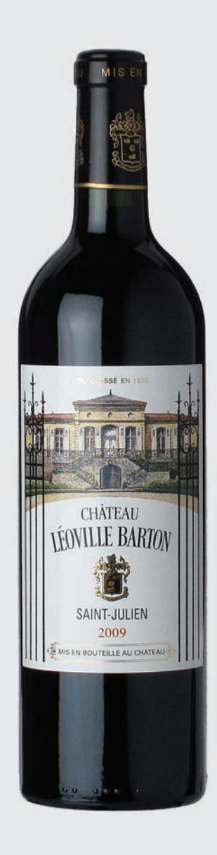
"We have a good supply of the 2009 Léoville-Barton, which was #6 on the Wine Spectator's Top 100 Wines of 2012."