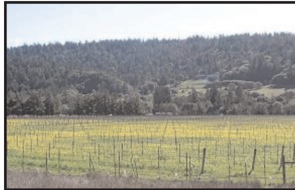
A vineyard in Mendocino's Anderson Valley.

Sauvignon Blanc is ideally suited for the region and this wine shows why. This 100% Sauvignon Blanc, made from Mendocino fruit by folks with Aussie roots, shows aromas of exotic citrus, fresh grapefruit and lime, which lead to a palate of ripe grapefruit and more lime framed by crisp acidity and a clean finish. Great choice with grilled rainbow trout and similar fish. Drink now and over the next two to three years.