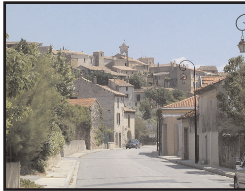
The town of Châteauneuf-du-Pape.

The history of wine in Châteauneuf-du-Pape begins in 1305, when the College of Cardinals, deadlocked eleven months in the Vatican over the appointment of a new pope, finally elected Bertrand de Got as Pope Clément V. The new pope was not Italian but French, and as former Bishop of Bordeaux founded the vineyards of Château Pape-Clément. A nationalist of true French temperament, Clément V moved the seat of the church from Rome to Avignon, at the Comtat Venaissan, which belonged to Rome as part of the settlement of the Treaty of Meaux of 1229. The 72-year period ending in 1377 during which the