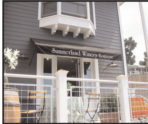
The tasting rooms at Summerland Winery.

This 100% Pinot Noir was aged for 11 months in French oak, 33% of which was new. Elegant and showy, the wine displays bright cherry and raspberry flavors with aromas highlighted by a hint of vanilla, spice and black tea. Drink now or hold for four to five years. Excellent with roast poultry.