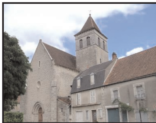
Church and buildings in Montfaucon.

This wine contains 60% Grenache, 20% Syrah, 10% Carignane and 10% Cinsault. The average age of the vines is over 40 years. The wine is very fruity with hints of cherries, raspberries, spice and licorice. The tannins are soft, making this a very easy wine to sip and enjoy by itself. It would be a good match served with hearty stews. Drink now and over the next three to five years.