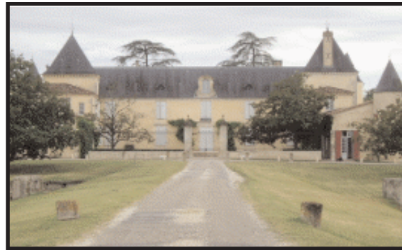
Château Suduiraut, famous for Sauternes.

The Château was built in the seventeenth century after the earlier fortress was destroyed by the Governor of Aquitaine under the reign of King Louis XIII. Its label features the legend "Ancien Cru Du Roy." This relates to both the Duroy owners and the subsidies given by King Louis XIV in recognition for the quality of the estate's wines. Mr. Fonquernie, a businessman, purchased the estate in 1940, and later passed it into the hands of his five daughters. The French group AXA-Millésimes bought it in the late 1980s. This Château is now managed by the well-known Jean-Michel Cazes. The vineyards are planted to 90% Semillon and 10% Sauvignon Blanc, the classic white grapes of Bordeaux.