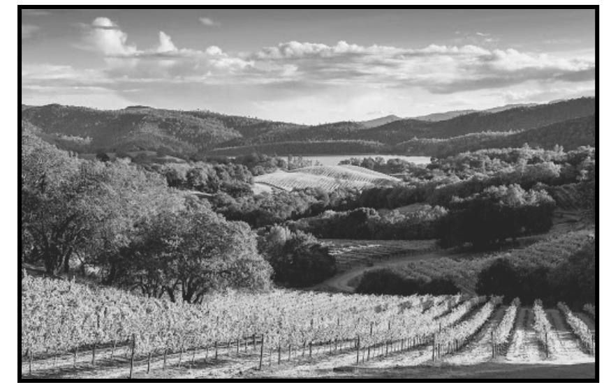
Buehler Vineyard's mountainside locale not only offers stunning views, it has one of the best terroirs for Cabernet in the St. Helena vicinity.