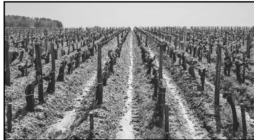
The Médoc commune is known for its flat and windy vineyard land, which makes growing grapes a challenge, but the soils here are very gravelly, which gives excellent drainage to the vineyards.