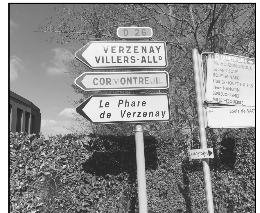
On the road to Forget-Brimont: the D-26, on the Montagne de Reims.

The Forget-Brimont Brut Rosé Champagne (34.99) comes from a sixth-generation grower with a substantial 45-acre estate. The vineyards for this producer range across the Premier Cru and Grand Crus of this hallowed ground for Pinot Noir. This rosé is composed of 40% Pinot Noir and 20% Chardonnay from the Grand